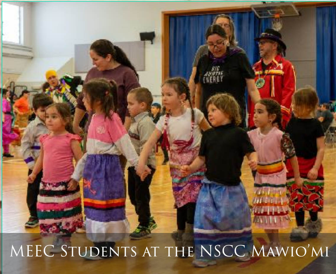
MEEC STUDENTS AT THE NSCC MAWIO'MI