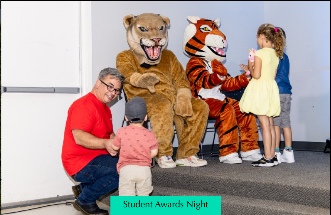
Student Awards Night