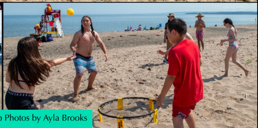
Summer Camp Photos by Ayla Brooks