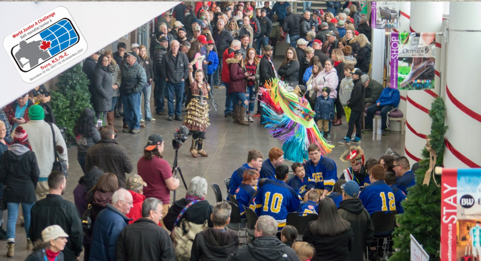
Samqwan Boyz and Dancers Performing at the World Junior A Challenge